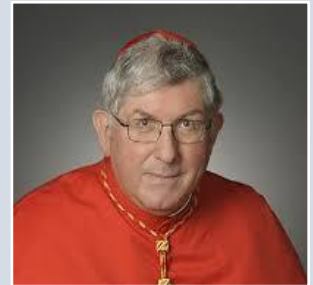
Special address by Cardinal Thomas Collins